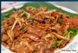
Char Kway Teow