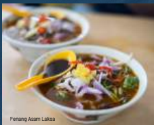
Penang Asam Laksa